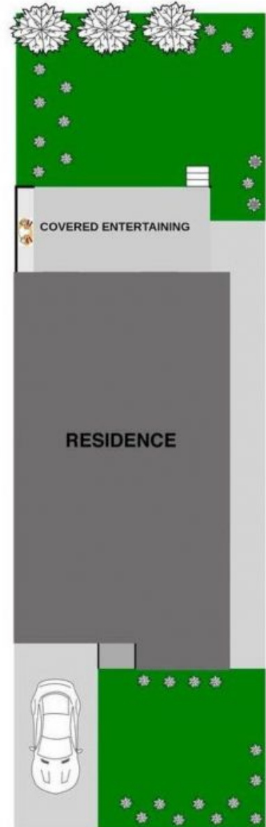
Site Plan (not to scale)