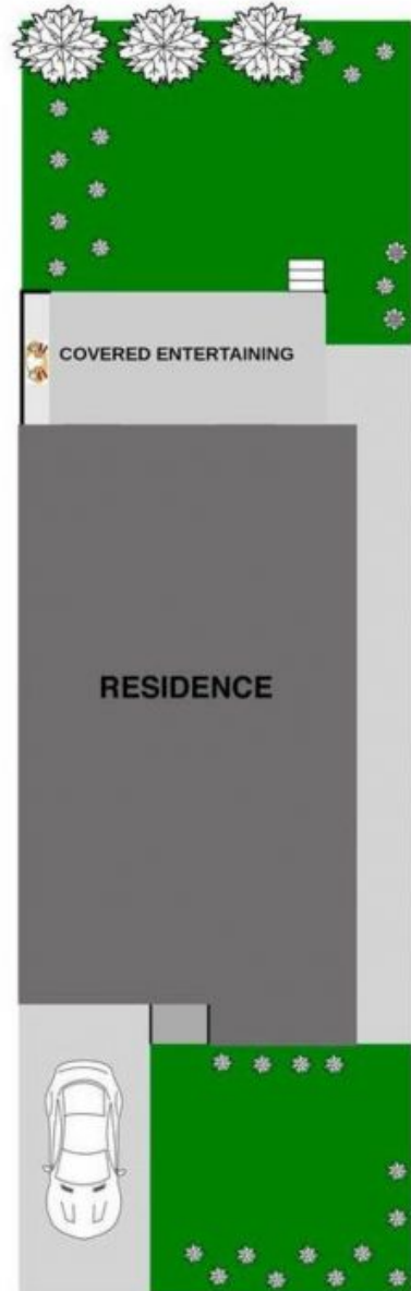
Site Plan (not to scale)