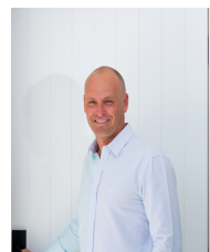
Matthew Callaghan Abbey Cadell

Perfectly proportioned throughout with an intuitive floorplan to suit todays needs, boasting two separate living spaces with seamless flow. Dress circle position located within walking distance to cafes, schools and neighbourhood shops.