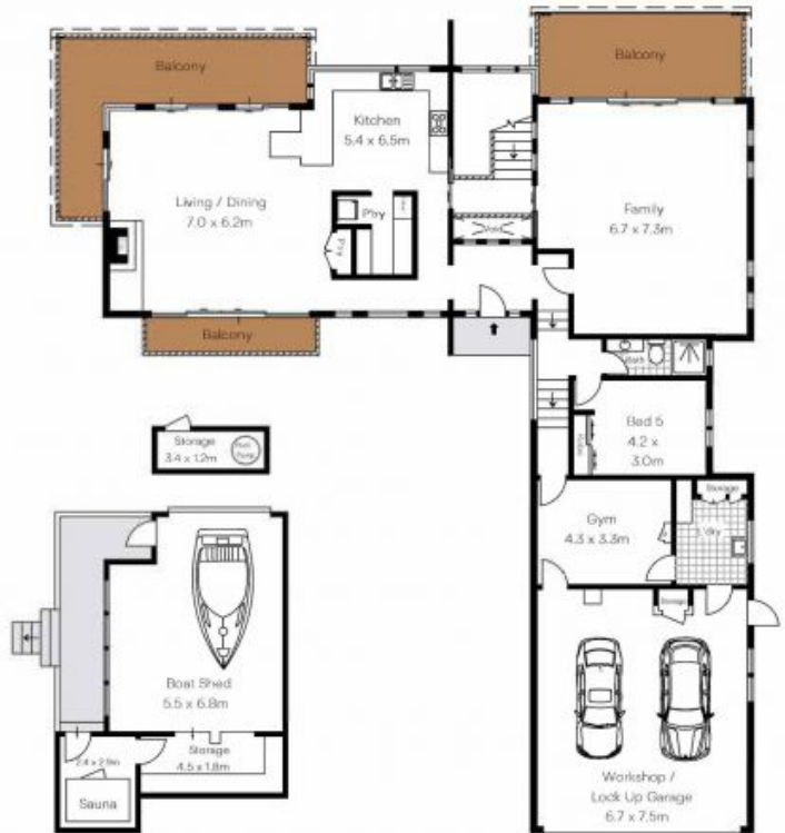
Water Front Level