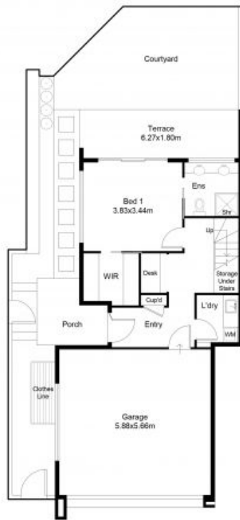
GROUND LEVEL PLAN ON SITE PLAN