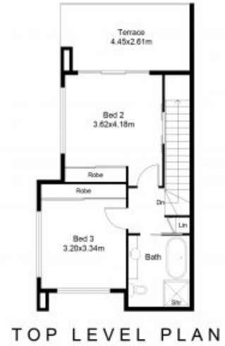
TOP LEVEL PLAN

This floor plan including furniture, fixture measurements and dimensions are approximate and for illustrative purposes only. BoxBrownie.com gives no guarantee, warranty or representation as to the accuracy and layout. All enquiries must be directed to the agent, vendor or party representing this floor plan.